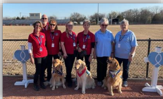
Comfort Dog Team members posing with the "Crosses For Losses" for the families of the 6 accident victims.