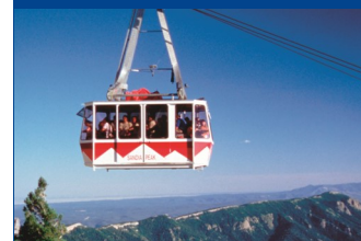
Breathtaking Views of the Sandia Mountains