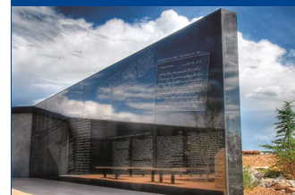
New Mexico Veterans' Memorial