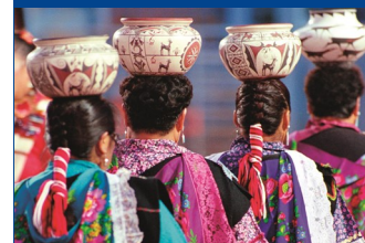
Native Southwestern Culture and Crafts